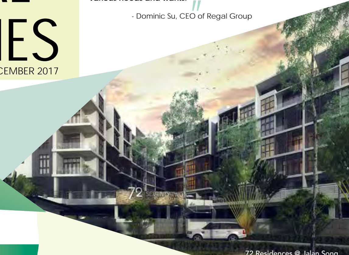
72 Residences @ Jalan Song (Artist Impression)