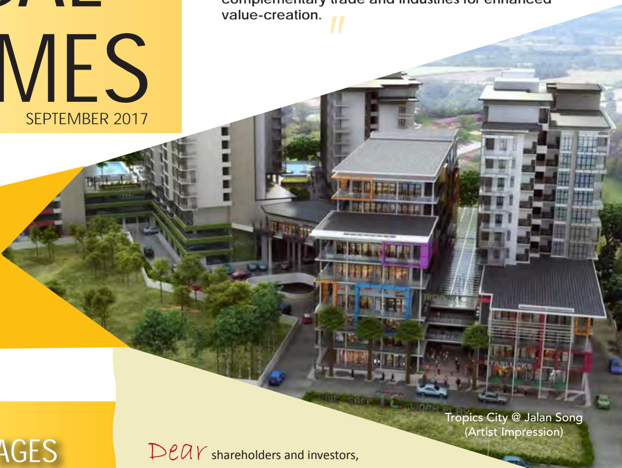
Tropics City @ Jalan Song (Artist Impression)

// The Group will continue to execute its property development forward strategies to increase market share and customer base; innovate property contents and values to create and stimulate new demands, and initiate strategic alliances with other complementary trade and industries for enhanced value-creation. //