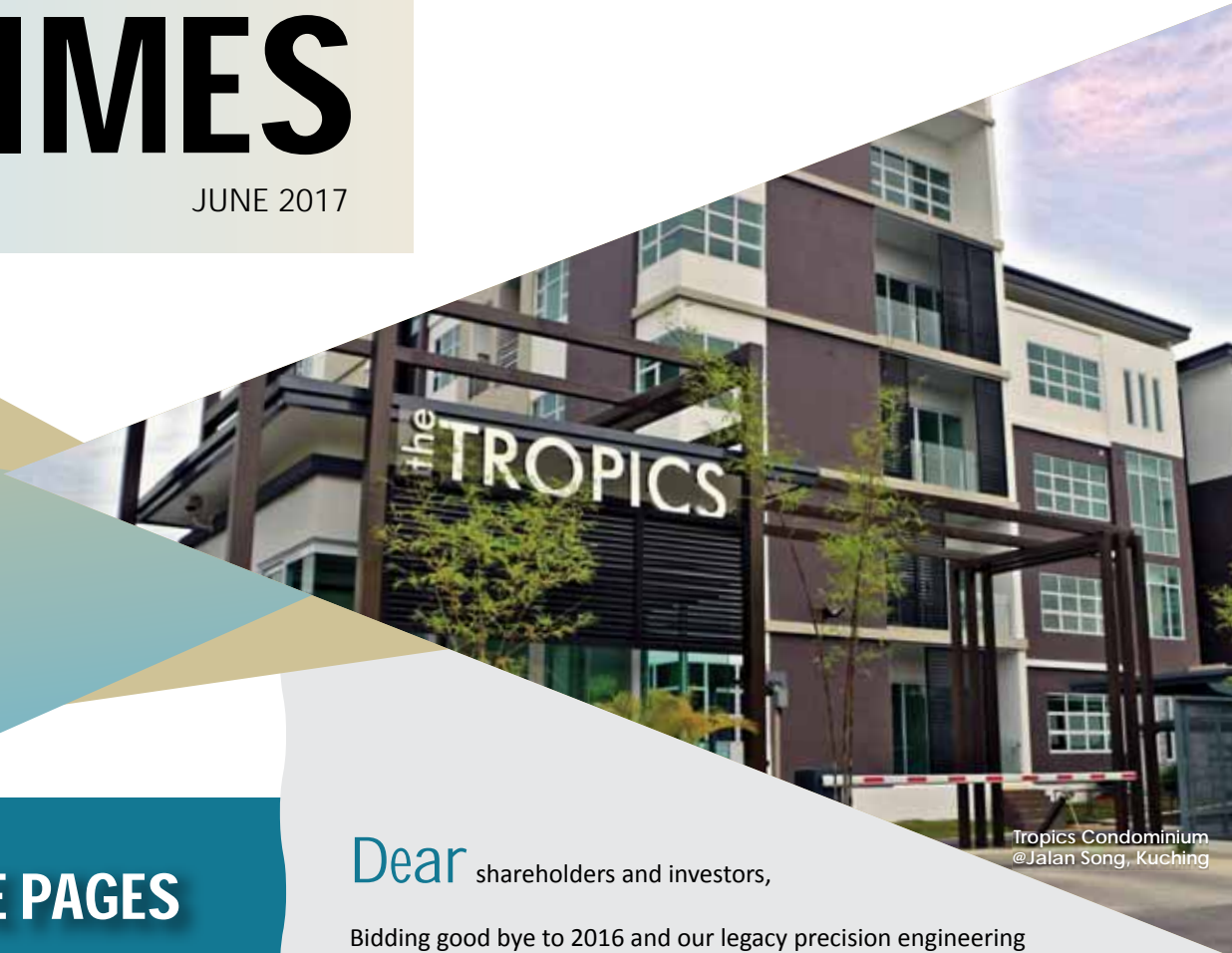
Tropics Condominium @Jalan Song, Kuching

- NRA Capital Research Report, 19 Jun 2017